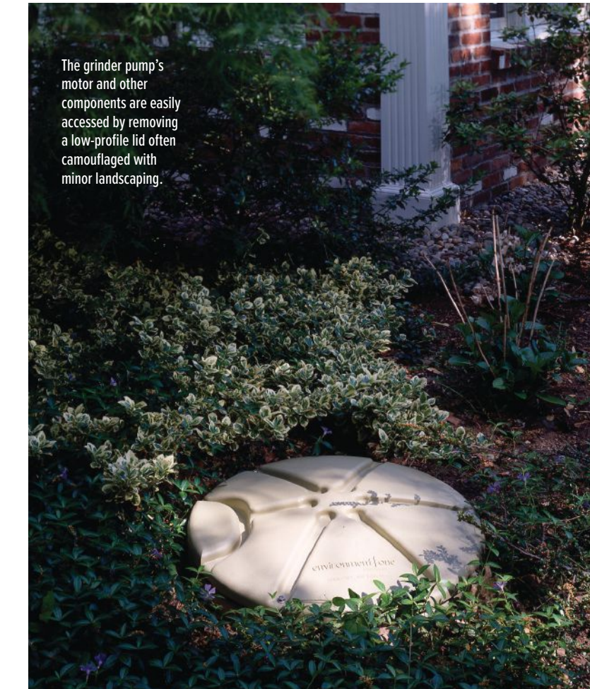
The grinder pump's motor and other components are easily accessed by removing a low-profile lid often camouflaged with minor landscaping.

He found that pressure sewers are especially advantageous for lakefront homes where lift stations can be eliminated and house elevations can be set