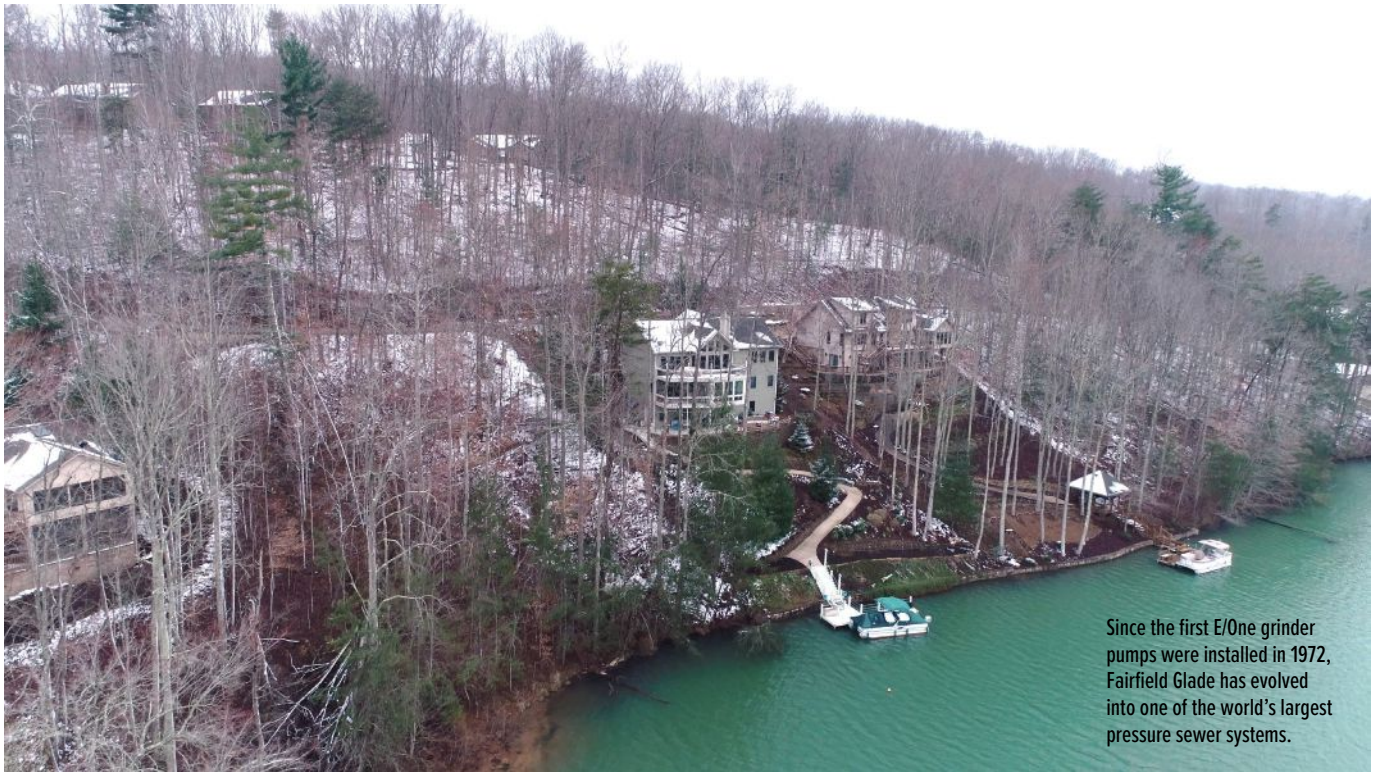
Since the first E/One grinder pumps were installed in 1972, Fairfield Glade has evolved into one of the world's largest pressure sewer systems.